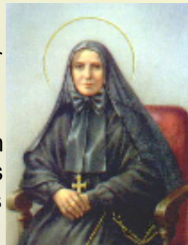
St. Frances Xavier Cabrini

We must pray without tiring, for the salvation of mankind does not depend upon material success . . . but on Jesus alone.