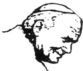
Pope John Paul the Great

Only the human person, created in the image and likeness of God, is capable of raising a hymn of praise and thanksgiving to the Creator. The earth, with all its creatures, and the entire universe call on man to be their voice.