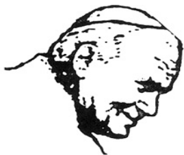
Pope John Paul the Great

Have no fear of moving into the unknown. Simply step out fearlessly knowing that I am with you, therefore no harm can befall you; all is very, very well. Do this in complete faith and confidence.