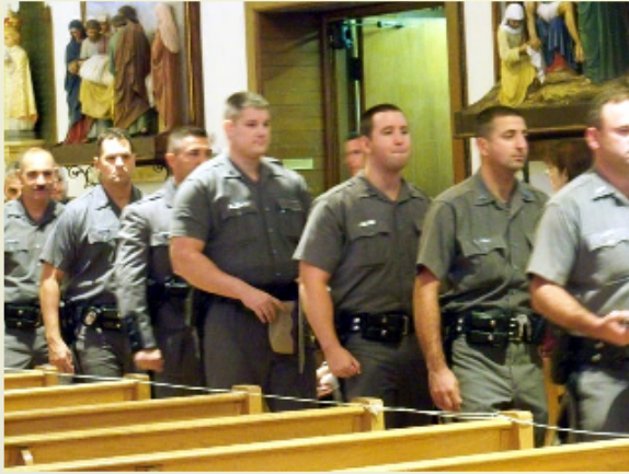
Annual Blue Mass for Emergency Personnel September 20th