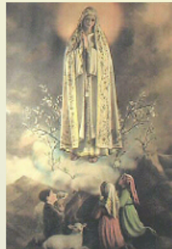
Our Lady of Fatima

"The sins of the world are very great ... If men only knew what eternity is, they would do everything in their power to change their lives."